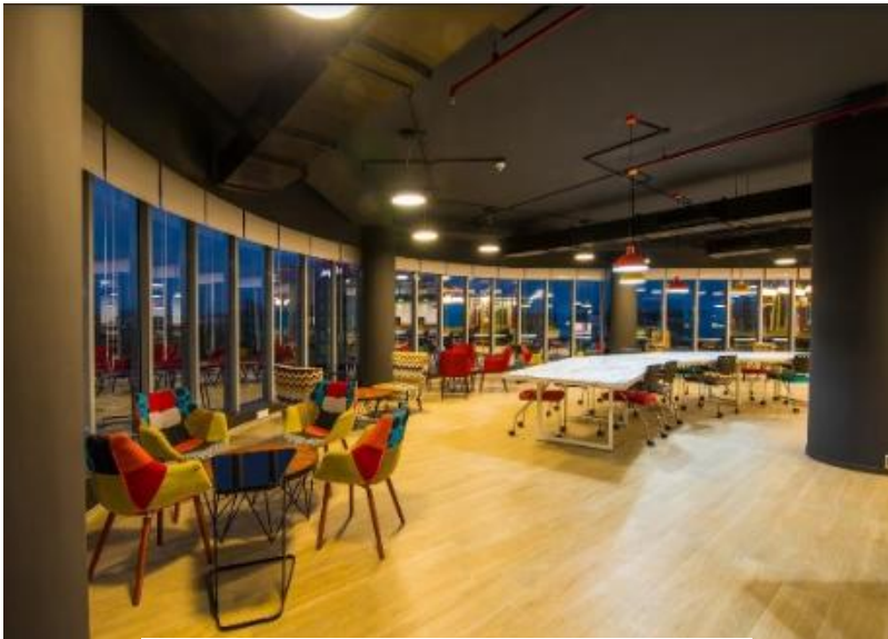
Coworking space by Vatika Business Centre

With the highest per capita income, Delhi offers immense opportunities for individuals to prosper in the state. Delhi's per capita is almost triple of the country's, making it most sought after 'job seeking' destination. The big statistical boost has made Delhi number 1 destination for migrants from all parts of the country. The rising population triggered the growth eruption of NCR evolving it as top spot for real estate investment. Due to this tangential development, areas such as Gurgaon, Noida and Greater Noida have emerged as the major urban centres of NCR.