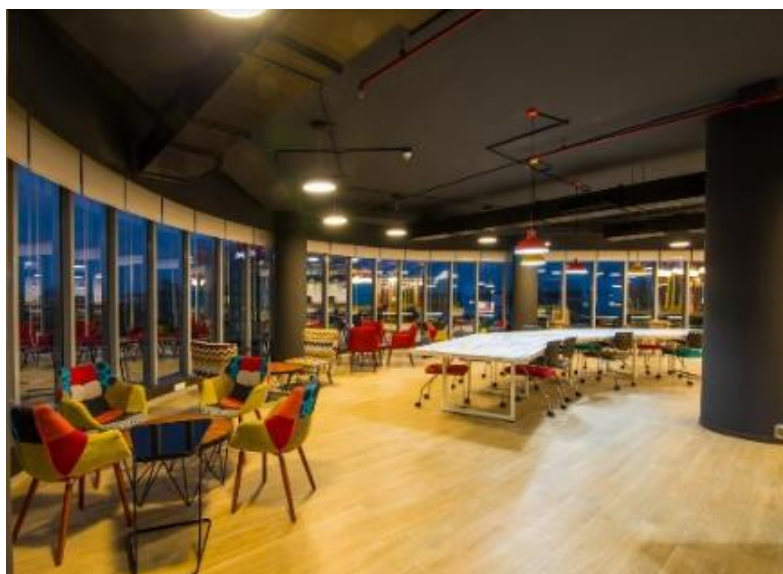
Coworking space by Vatika Business Centre

With the highest per capita income, Delhi offers immense opportunities for individuals to prosper in the state. Delhi's per capita is almost triple of the country's, making it most sought after 'job seeking' destination. The big statistical boost has made Delhi number 1 destination for migrants from all parts of the country. The rising population triggered the growth eruption of NCR evolving it as top spot for real estate investment. Due to this tangential development, areas such as Gurgaon, Noida and Greater Noida have emerged as the major urban centres of NCR.