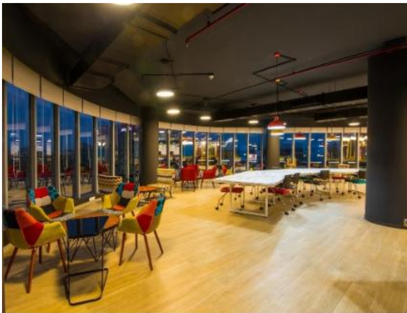
Coworking space by Vatika Business Centre

With the highest per capita income, Delhi offers immense opportunities for individuals to prosper in the state. Delhi's per capita is almost triple of the country's, making it most sought after 'job seeking' destination. The big statistical boost has made Delhi number 1 destination for migrants from all parts of the country. The rising population triggered the growth eruption of NCR evolving it as top spot for real estate investment. Due to this tangential development, areas such as Gurgaon, Noida and Greater Noida have emerged as the major urban centres of NCR.