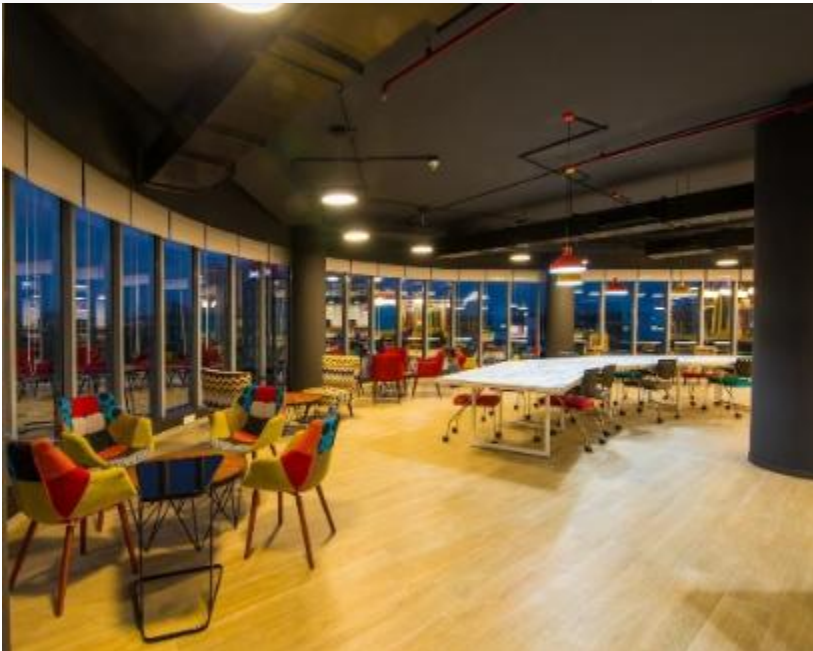
Coworking space by Vatika Business Centre

With the highest per capita income, Delhi offers immense opportunities for individuals to prosper in the state. Delhi's per capita is almost triple of the country's, making it most sought after 'job seeking' destination. The big statistical boost has made Delhi number 1 destination for migrants from all parts of the country. The rising population triggered the growth eruption of NCR evolving it as top spot for real estate investment. Due to this tangential development, areas such as Gurgaon, Noida and Greater Noida have emerged as the major urban centres of NCR.