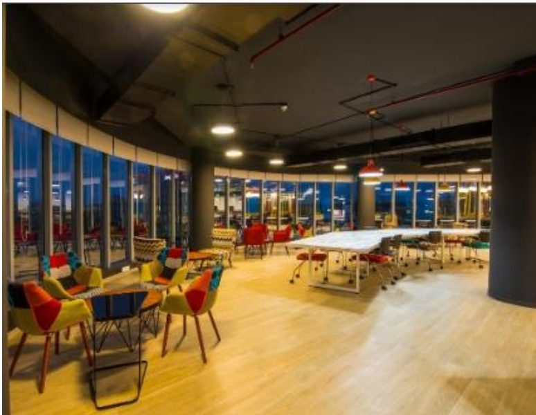
Coworking space by Vatika Business Centre

With the highest per capita income, Delhi offers immense opportunities for individuals to prosper in the state. Delhi's per capita is almost triple of the country's, making it most sought after 'job seeking' destination. The big statistical boost has made Delhi number 1 destination for migrants from all parts of the country. The rising population triggered the growth eruption of NCR evolving it as top spot for real estate investment. Due to this tangential development, areas such as Gurgaon, Noida and Greater Noida have emerged as the major urban centres of NCR.