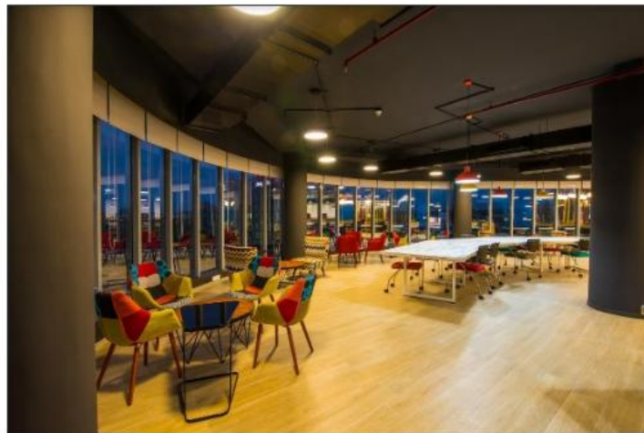
Coworking space by Vatika Business Centre

With the highest per capita income, Delhi offers immense opportunities for individuals to prosper in the state. Delhi's per capita is almost triple of the country's, making it most sought after 'job seeking' destination. The big statistical boost has made Delhi number 1 destination for migrants from all parts of the country. The rising population triggered the growth eruption of NCR evolving it as top spot for real estate investment. Due to this tangential development, areas such as Gurgaon, Noida and Greater Noida have emerged as the major urban centres of NCR.