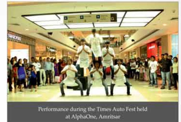
Performance during the Times Auto Fest held at AlphaOne, Amritsar

we have been able to keep our promise of offering, 'Something Special ...Har Baar!' Recently, various business ideas by college students were showcased at AlphaOne, a first by any city centre in Gujrat. We also had several fun-filled activities like, Kwality Walls' hunt for the Cornetto couple where film stars like Yami Gautam and Siddharth Malhotra came and interacted with customers at AlphaOne. Besides, a Drawing Competition and other craft workshops were organized during the summer holidays to gainfully occupy young students of the city. Another landmark activity that kept our patrons delighted was Times Auto Fest. An activity that brought 2 wheelers from 3 companies and 7 cars, all under one roof for 3 days. Besides, the latest model of Ford 'EcoSport' was also launched in Gujarat, only at AlphaOne.