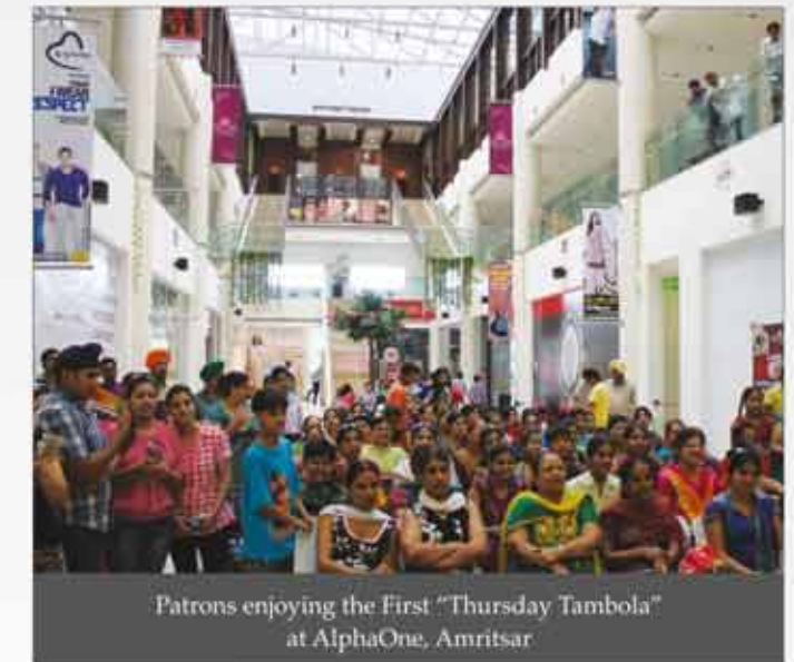
Patrons enjoying the First "Thursday Tambola" at AlphaOne, Amritsar