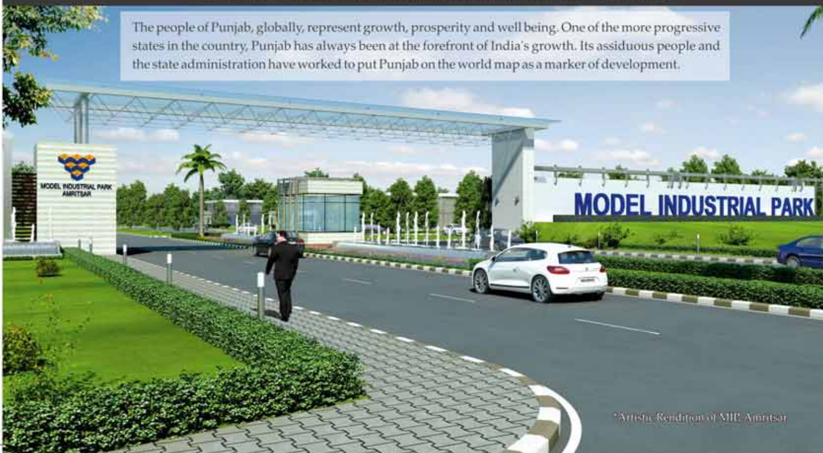
*Artistic Rendition of MIP, Amritsar

The people of Punjab, globally, represent growth, prosperity and well being. One of the more progressive states in the country, Punjab has always been at the forefront of India's growth. Its assiduous people and the state administration have worked to put Punjab on the world map as a marker of development.