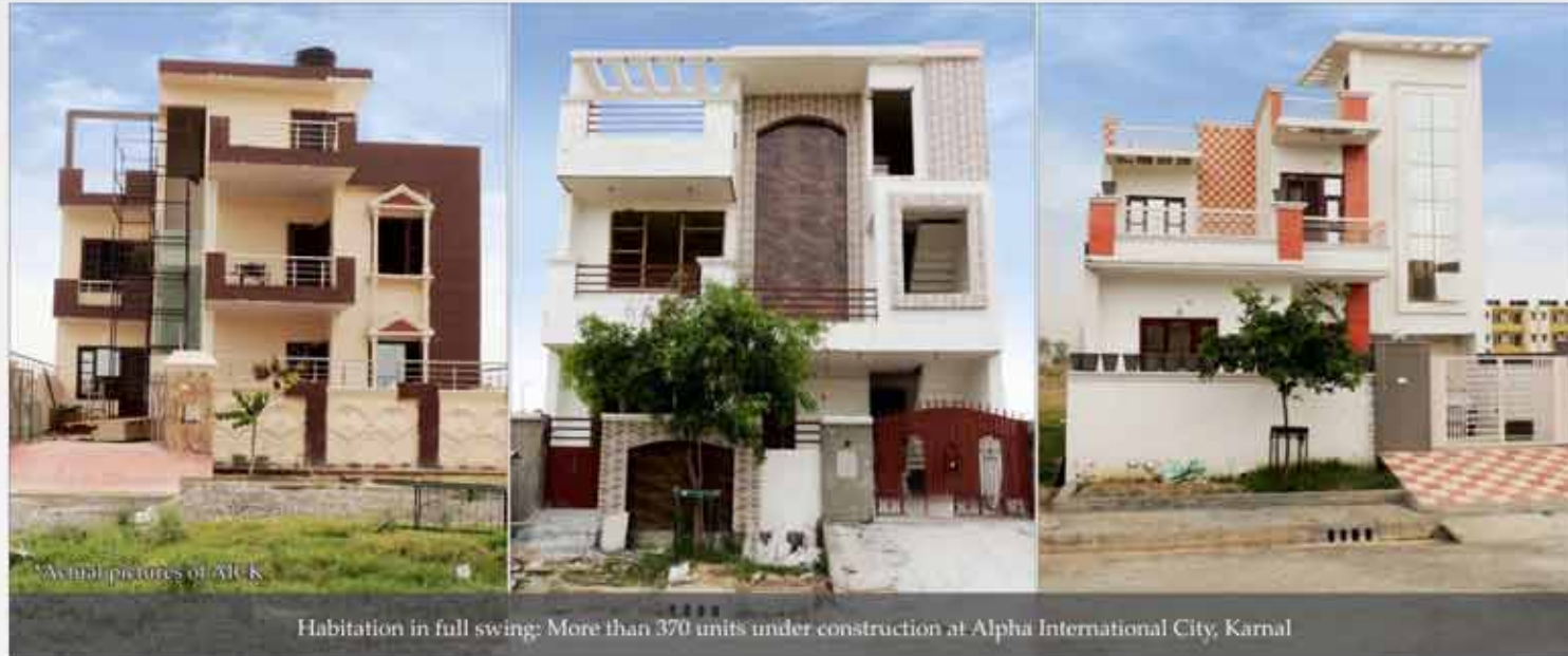
Habitation in full swing: More than 370 units under construction at Alpha International City, Karnal

With 141 acres already delivered in Phase-I and 85 acres under development in Phase-II, Alpha International City Karnal (AICK) is seeing a spurt in construction of new houses and inhabitation. It's strategic location connected by two important highways and infrastructure at par with international standards makes AICK not only the best development in Karnal, but also the best investment on the G.T. road. The township is in close proximity to the recently announced inter-state bus terminal, domestic airport and the proposed Kalpana Chawla Medical College.