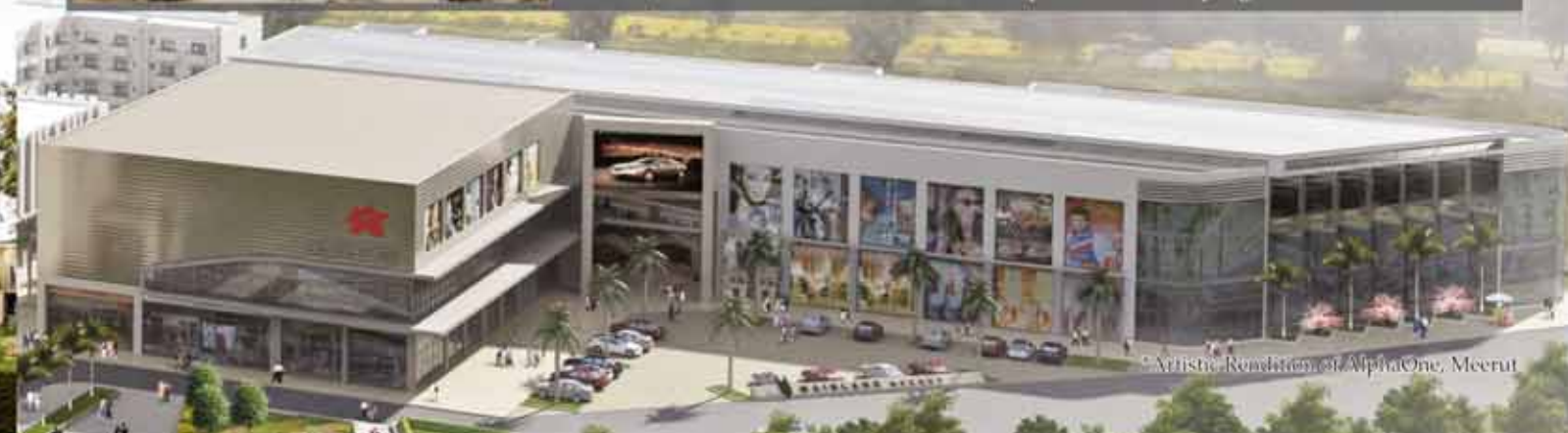
*Artistic Rendering of AlphaOne, Meerut