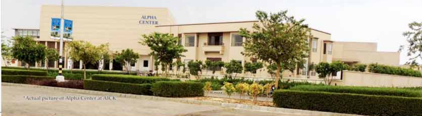
*Actual picture of Alpha Center at AICK