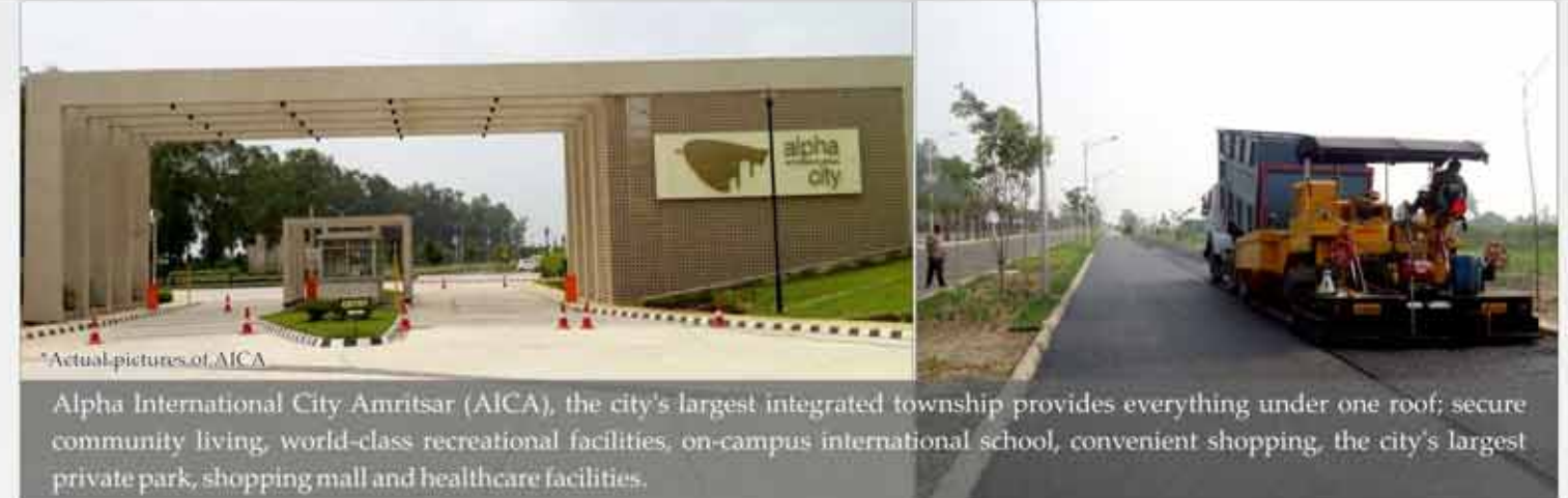
*Actual pictures of AICA

Alpha International City Amritsar (AICA), the city's largest integrated township provides everything under one roof; secure community living, world-class recreational facilities, on-campus international school, convenient shopping, the city's largest private park, shopping mall and healthcare facilities.